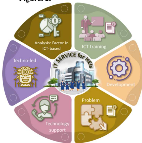
Figure 2: Components of information technology service for Higher Education Institutions (HEIs)

6.2.2 Information technology for higher education institutions (HEIs) show as Figure. 2.