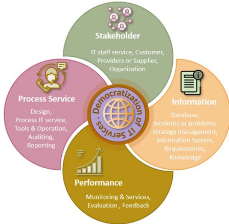
Figure 1: Components of Democratization of information technology service

6.2.1 Democratization of information technology service show as Figure. 1.